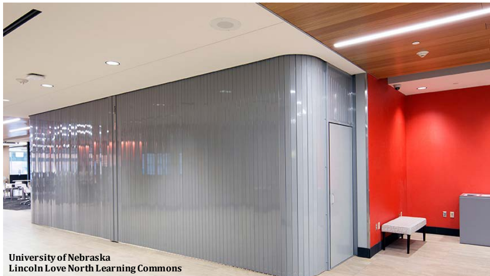
University of Nebraska Lincoln Love North Learning Commons